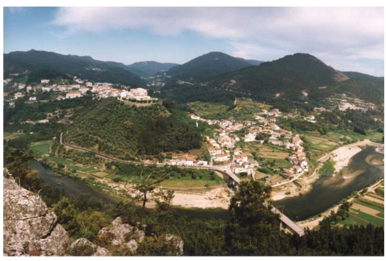
Vista sobre Penacova